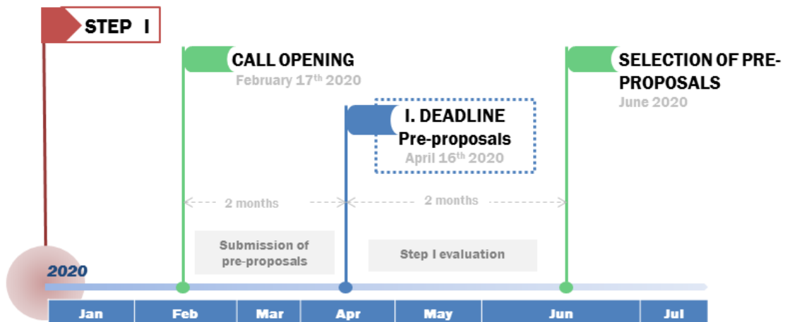
Figure 1: Step 1 process (! New deadline for pre-proposal submission)

The Consortium Coordinator must submit a pre-proposal on behalf of the consortium, providing key data on the proposed project. The deadline for the submission of the pre-proposal is 18.05.2020, 17:00 CEST (Berlin time).